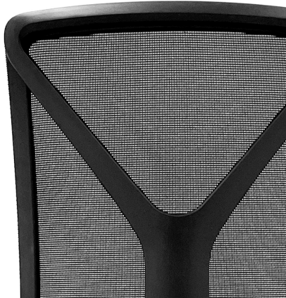
Y-structure The distinctive Y-structure, combined with a sophisticated mechanism for great ergonomics.