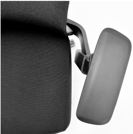
Armrest – Adjustable The chair is supplied with armrests that may be adjusted in angle and height.