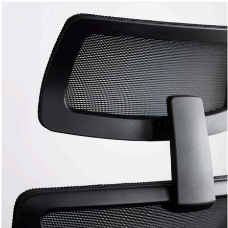
Headrest – Adjustable Eve is available with an optional headrest to relieve and provide comfort to the neck.