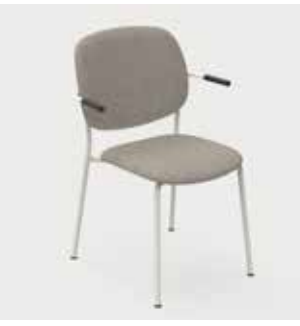
4-Legged with armrest