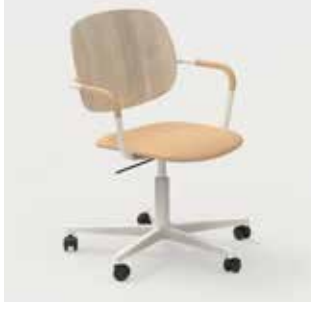
5-Star Swivel Base