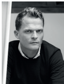
Designer Andreas Engesvik

The Gather Sofa stretches in a stately manner from armrest to armrest, with generous and well-fitted proportions. The sofa's solid-cast impression is enhanced by the characteristic running seam. Gather Sofa is perfect for the workplace or even the home. Choose fixed length with solid upholstery or fixed length with separating seams. The Sofa is available in two-seater and three-seater versions, and your choice of upholstery will give it the expression and attitude you desire.