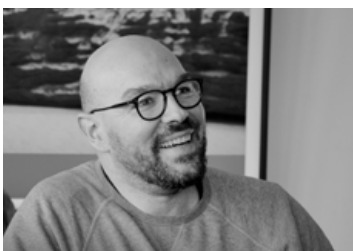
Design Luca Nichetto

This nomadic furniture, is built with a hollow cylinder in recycled cardboard and leftover material from Edsbyn's production. With a tactile metal handle in Swedish steel on the side, and an upholstered seat that can be combined in various colors, Cup is sure to add flavour to the room.