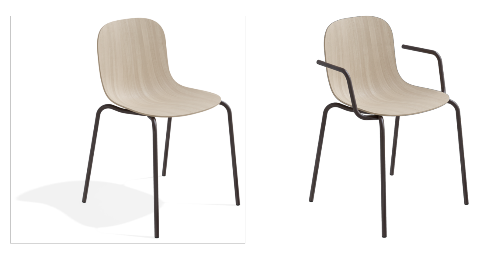
A trim and elegant shell chair in 3D-moulded veneers. The slender conformed seat offers a unique fit with a natural resilience in the back.